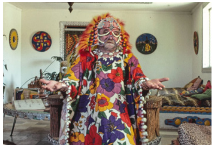
Photo of Eddie Martin courtesy of the South-Central Georgia Folklife Project collection (AFC 1982/010), American Folklife Center, Library of Congress. Photographer: Carl Fleischhauer.