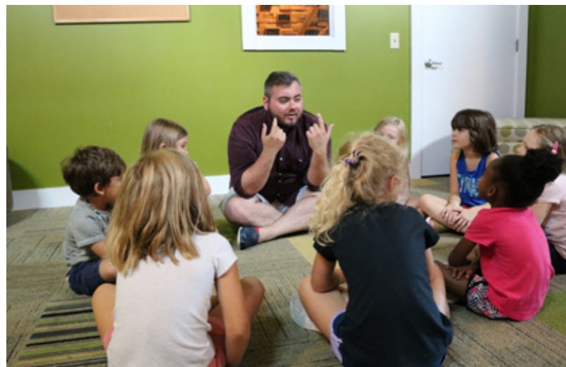
Averitt Center for the Arts.