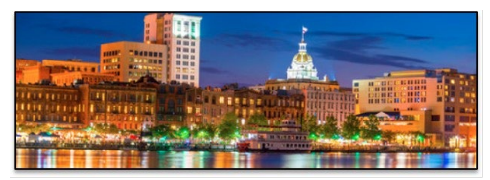
FAQs for 2024 GMA Annual Convention

Please check back periodically for updates to this document. We will continue to add information that you may find useful as we near the start of the 2024 GMA Annual Convention in Savannah June 21-25, 2024